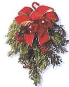
Farmhouse Fresh Pine Swag