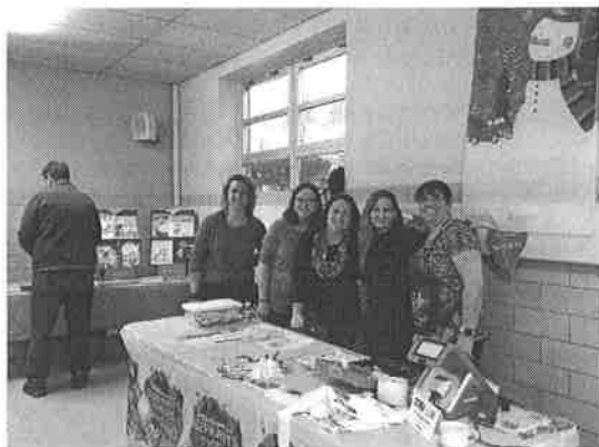
Some moms who ran the book fair at Open House

On Sunday, January 26, ICS held an open house at the school. Open house this week marked the start of Catholic Schools Week! We had all kinds of people helping with the open house; here are some volunteers who helped out: