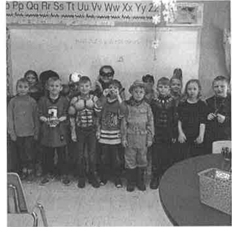
Picture of ICS's second grade dressed up as superheroes